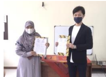
3. Darul Hikam Kindergarten