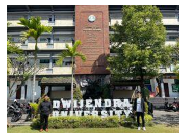
5. Dewi Jundela Kindergarten