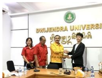
5. Dewi Jundela Kindergarten