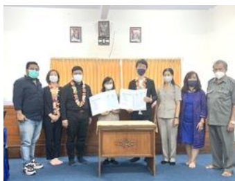
4. Bali Public School Kindergarten