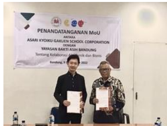
2. Bhakti Asi School