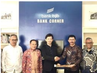
1. Sangha Buana University